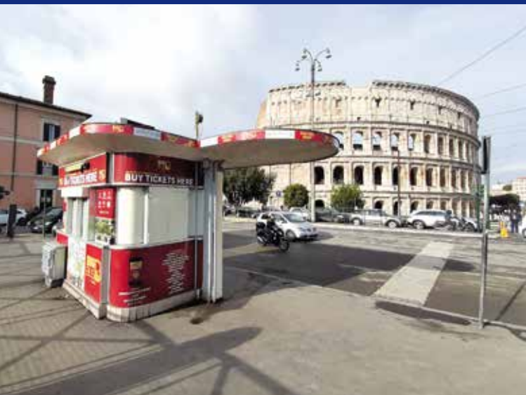
Piazza del Colosseo (Big Bus Tours/Brastours Kiosk)