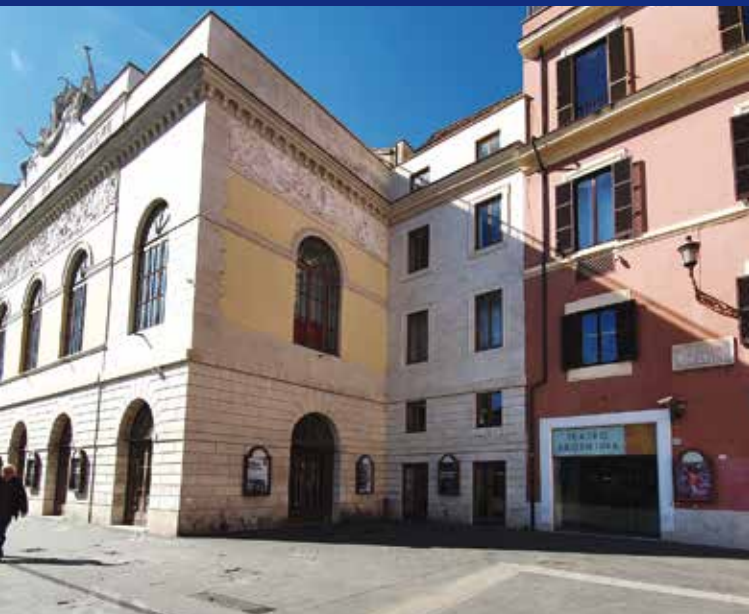
Via/Largo di Torre Argentina, 52 (Teatro Argentina)